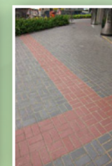
Trans Glass Pavers