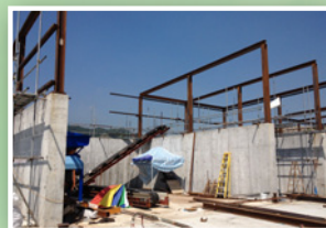
貯存再造材料於堆料區 Storage of recycled aggregate at stockpile area