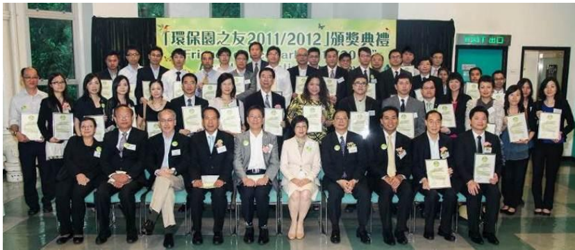
"Friends of EcoPark 2011/12" Award Presentation Ceremony marked another year of success of the Scheme.